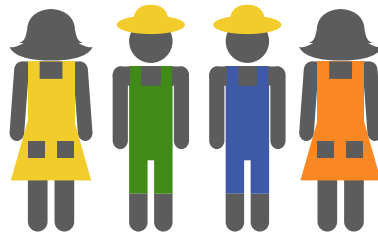
Pennsylvania producers use the money to harvest surplus product.