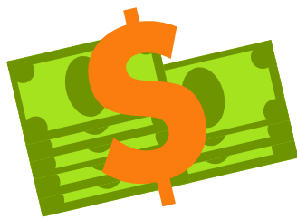
Pennsylvania Department of Agriculture allocates funding for PASS.