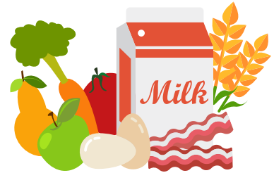
Pennsylvania families in need get access to fresh food!